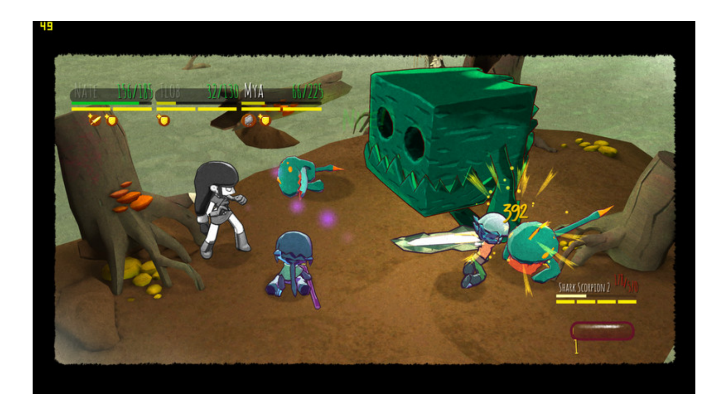
Spirit Roots Activation Code [Ativador]

Download >>> <a href="http://bit.ly/2SGY1S4">http://bit.ly/2SGY1S4</a>